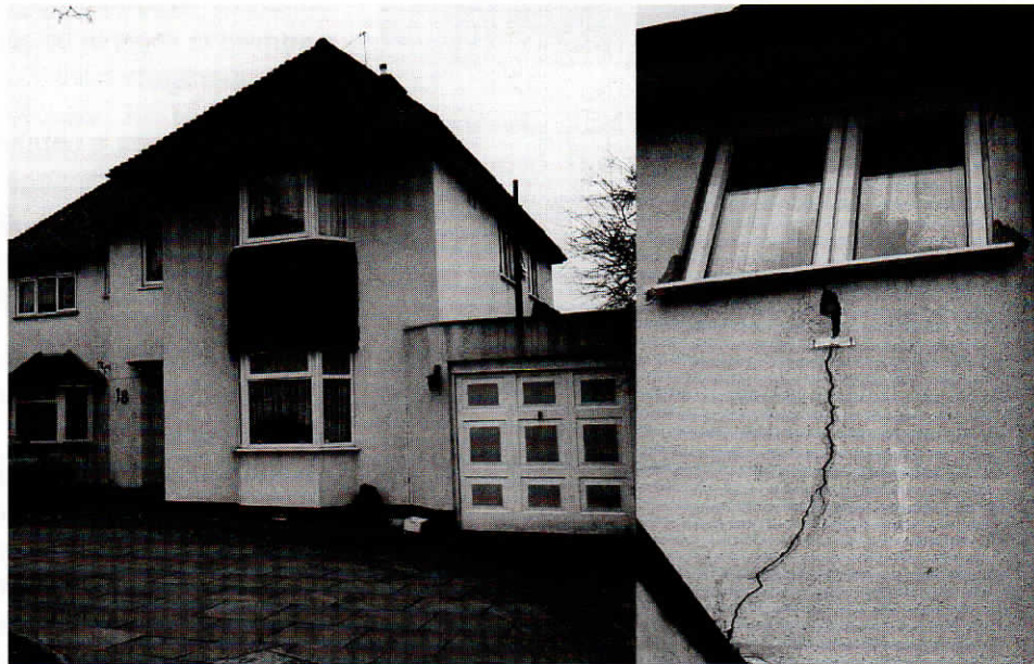
Building with structural cracking

A growing tree root, increasing in diameter, exerts pressure on the soil around it - a steady, persistent, but increasing force. Where a root is in contact with an obstacle (e.g. a rock or building foundation) the force will be transmitted to that object. Because the force