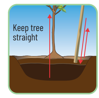
Backfill with removed soil, gently compact with stake or boot