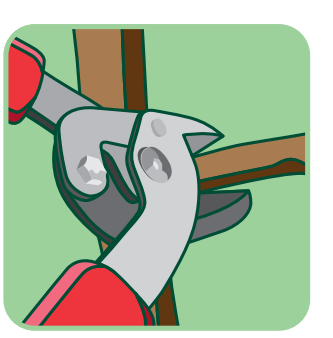
Consider formative pruning before setting in place