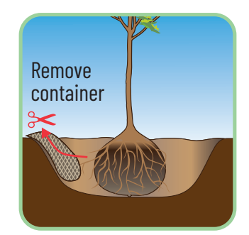
Remove any container or hessian