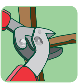
Consider formative pruning before setting in place