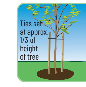
Allow for wind movement with two stakes and rubber ties