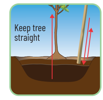
Backfill with removed soil, gently compact with stake or boot