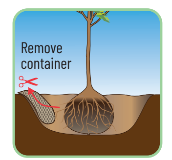
Remove any container or hessian