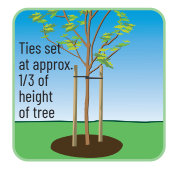
Allow for wind movement with two stakes and rubber ties