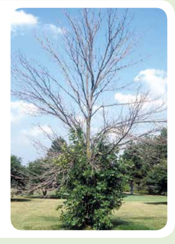
Epicormic growth Due to stress, the tree produces epicormic shoots on the trunk and roots, but can also be found in the tree crown, stems and larger branches.