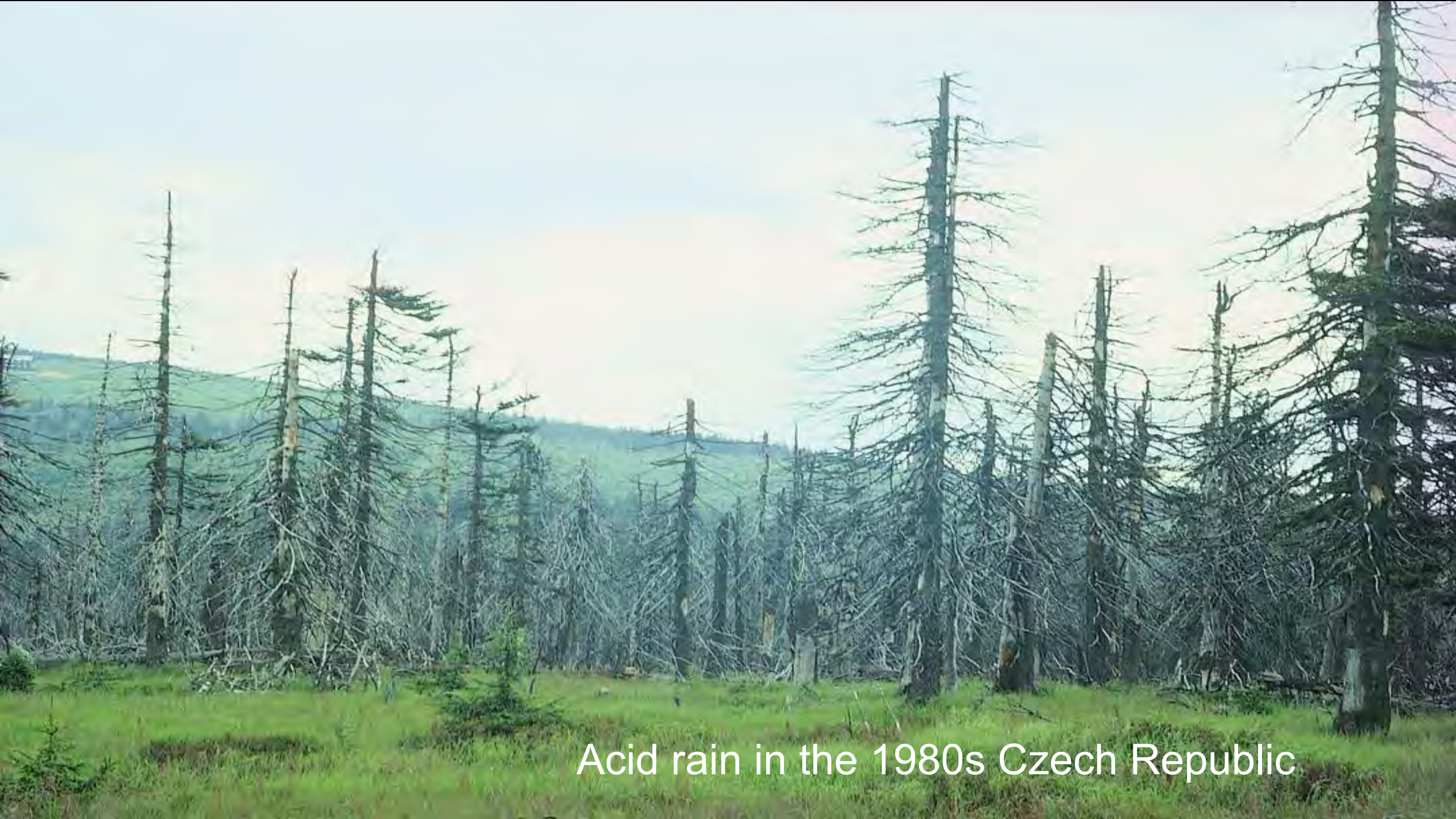
Acid rain in the 1980s Czech Republic