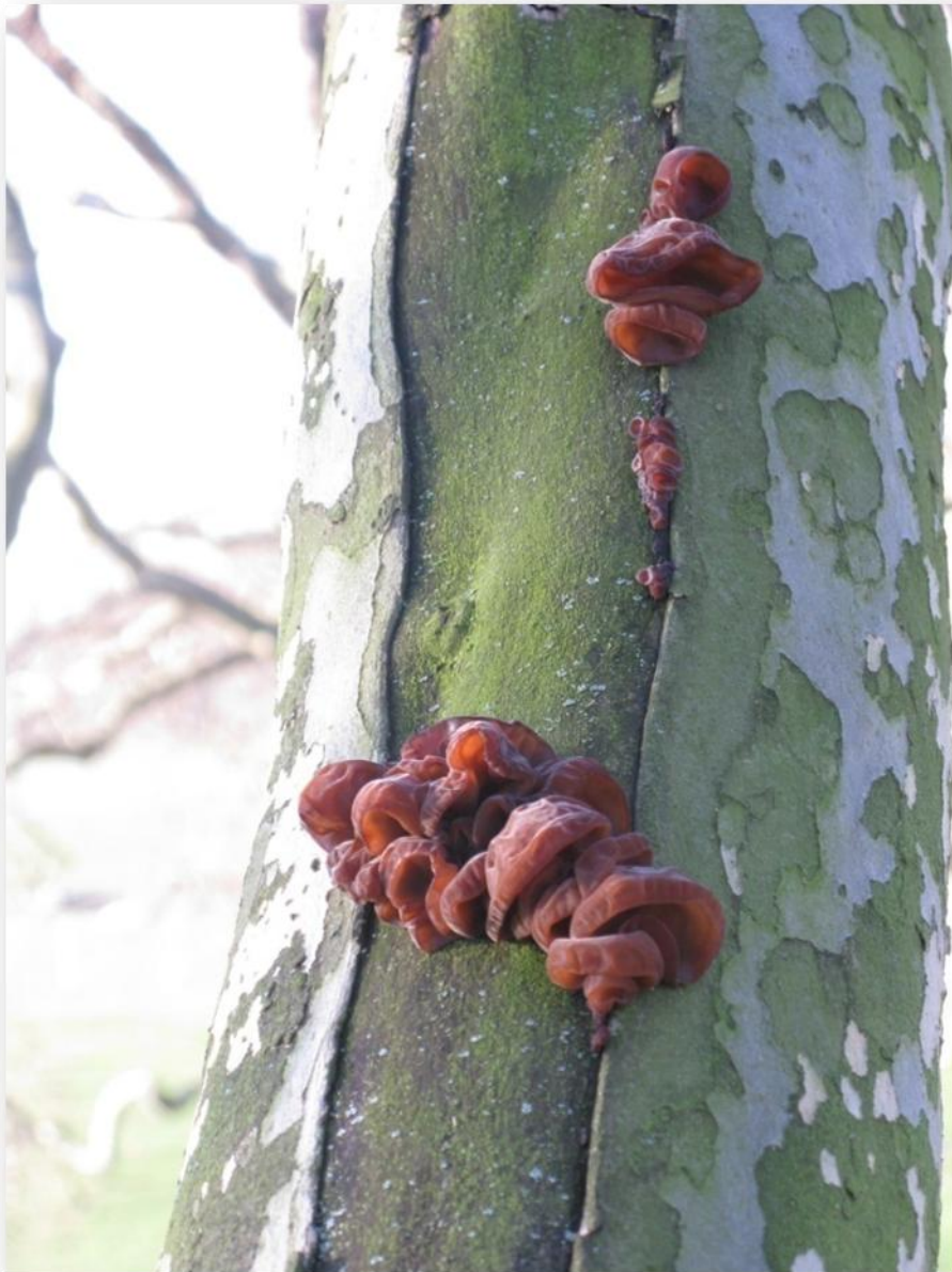
Auricularia (secondary) fungi on dead bark strip

On larger diameter limbs it is much more difficult to spot but there may be secondary fungal fruit bodies (e.g. Auricularia ) along the upper side of a limb or dead branches or twigs arising from the upper side of the limb along the dead strip.