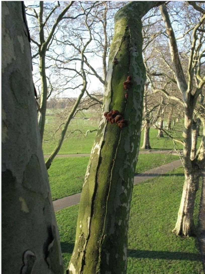
Aerial shot of dead bark strip caused by Massaria (Hyde Park).

A strip of dead bark starting at the branch collar, and stretching along the top of the branch. The width of the dead strip varies but nearly always tapers to a distinct point.