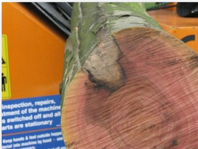
Cross section of decay

On fallen limbs white fungal mycelium may be present at the break point and a clearly zoned area of decay may be present.