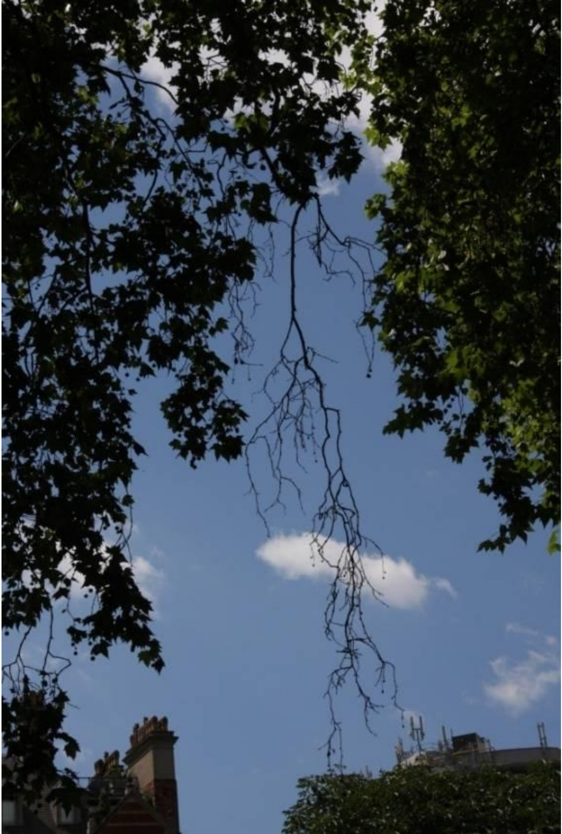
Twigs on recently dead branch, buds and undeveloped fruit intact