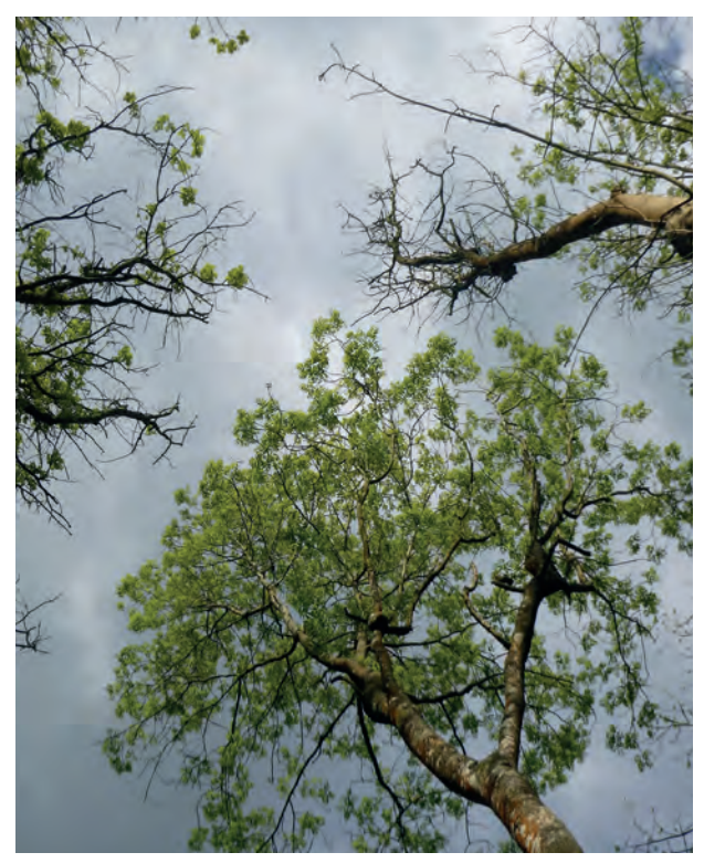
Ash dieback – infected canopy.

Evidence of tolerance or evidence of trees seemingly escaping the disease because, for example, they