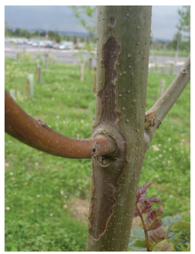
Ash dieback – lesion on 4 year old ash.

For the 2012 plant health order: www.legislation.gov.uk/uksi/2012/2707/ contents/made