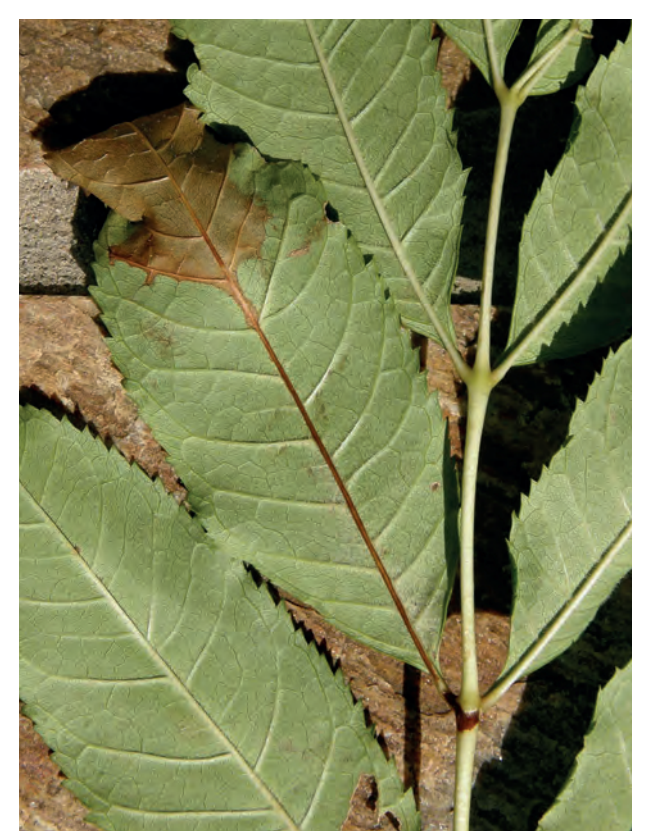
Ash dieback – leaf symptoms.