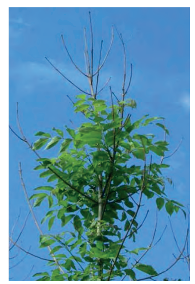
Ash dieback – infected sapling.

Please note , in certain circumstances you may still need other permissions from other organisations before you can fell the tree(s), even if you do not need a felling licence.